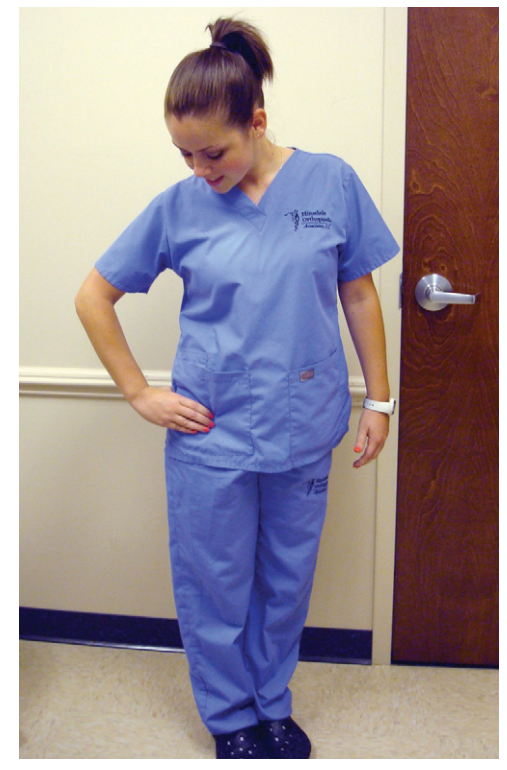
Figure 3. C-sign. Patients with femoroacetabular impingement often point to the area of pain by cupping the thumb and index finger in the shape of the letter C.

Figure 2 . Hip impingement, cam and pincer mechanisms. A pincer mechanism results from excessive overhang of the acetabulum, which causes the labrum to be impinged between the acetabulum and femoral head upon hip flexion. A cam mechanism occurs when exostosis along the femoral head and neck impinges the labrum against the acetabulum.