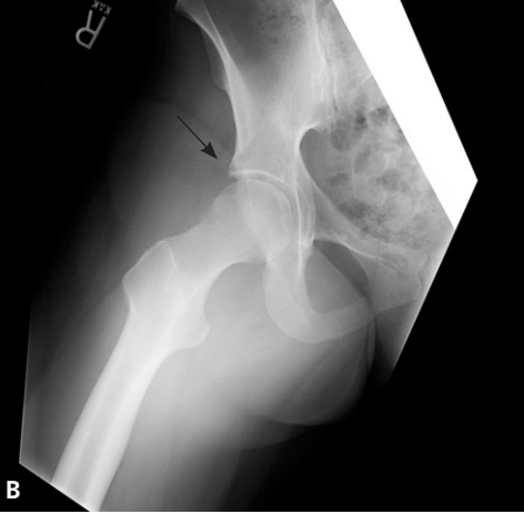
Figure 6. Pincer lesion. ( A ) Modified Dunn view of a hip with a pincer lesion ( arrow ). ( B ) Postoperative radiograph shows that the pincer lesion ( arrow ) is reduced.